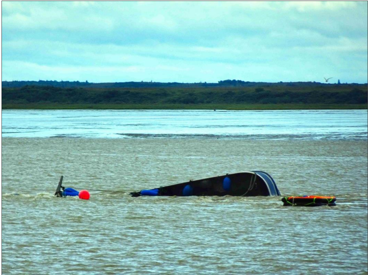
Starboard quarter of the Pacific Knight.

The captain of the Amanda C then noticed a person in the water drifting toward them. He used the engine and rudder to maneuver the vessel, and he had the deckhands pick him up from the starboard side main deck. Once aboard, the person who identified himself as the captain of the Pacific Knight told the Amanda C captain that two crewmembers were missing. The Amanda C deckhands hauled in the anchor and headed toward the Pacific Knight . Shortly after, the 16-year-old was spotted and the deckhands were able to get a life ring to him and pull him on board. The Amanda C captain stated that the “kid” was very weak when they got him on board, noting they had to put him in the shower and gently bring his body temperature back up. With support from other boats in the area, the search then continued for the senior deckhand, but he was not found.