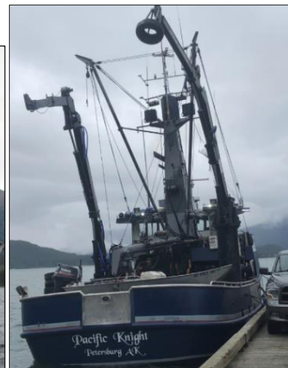
Left; undated photo of the Pacific Knight (then named the Lone Fisherman ) with the aft deckhouse that was removed (highlighted in red). Right: the Pacific Knight while moored alongside a dock on June 10, 2018, with the two added cranes.

According to a report filed by the state and wildlife troopers, a crewmember on the Amanda C informed them that the two large cranes on the deck of the Pacific Knight required frequent positioning to maintain proper balance of the boat. When the Pacific Knight was refloated, the starboard crane was found in the extended position above the deckhouse and the port crane was found with its boom extended to the top of the deckhouse and knuckled down to the port corner of the main deck.