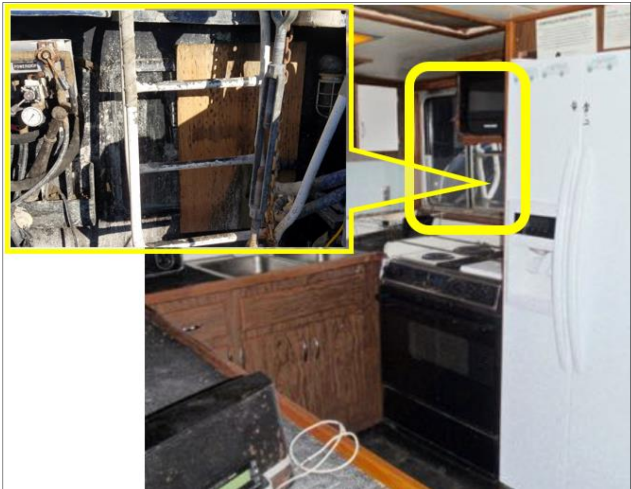
Galley area and window, marked by a yellow rectangle, from where the deckhand escaped. Inset: post-casualty picture of the ladder on the main deck that was in front of the window. The window was later boarded up by the salvors.

According to the captain of the fish tender Fayette , which was at anchor less than 100 yards forward of the Pacific Knight on the port side, he was sitting in his helm chair having a cup of coffee when he noticed the Pacific Knight list to port and capsize. He stated the vessel rolled over so quickly that he could not believe that anyone would have made it out of the vessel.