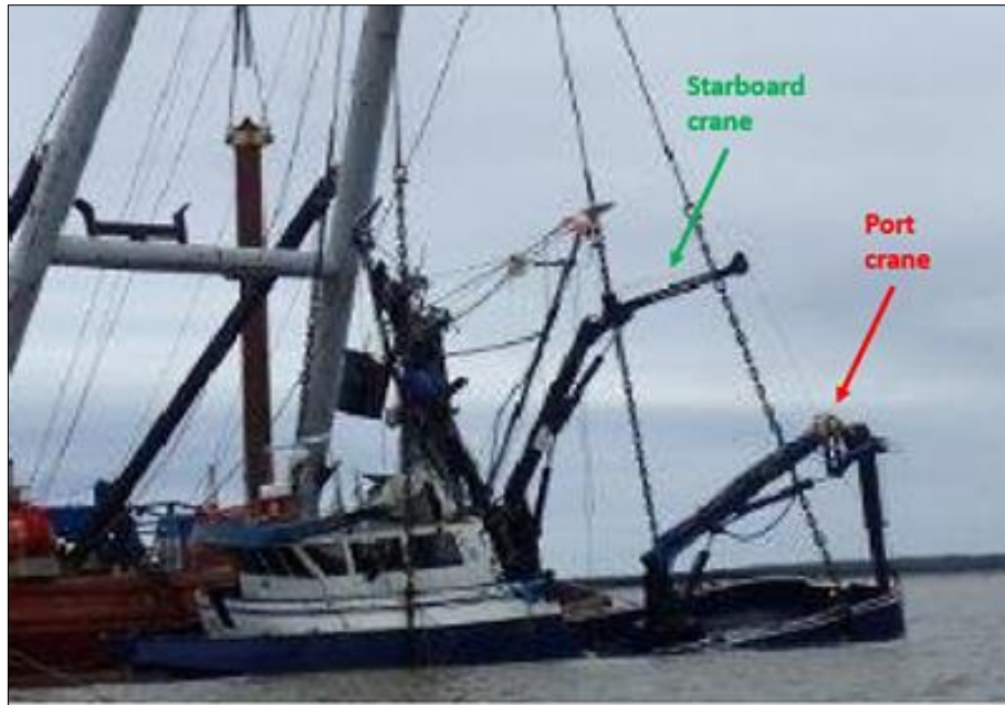
Pacific Knight while it was salvaged, with the crane positions visible.

The Pacific Knight had six fuel tanks with a total capacity of 6,350 gallons of diesel fuel. Each tank was located outboard on each side of the aft fish hold, the main fish hold, and the engine room. The captain told the Coast Guard that at the time of the accident, only two tanks were holding fuel: the port and starboard tanks (1,307-gallon capacity each) outboard of the main fish hold. He said the vessel was last fueled the day before the accident from another fish tender, the Bella Catherine . He did not indicate the precise quantities in each tank. In a report from the Alaska Department of Environmental Conservation, dated August 22, 2018, the salvage company removed 1,439 gallons of diesel fuel from the Pacific Knight .