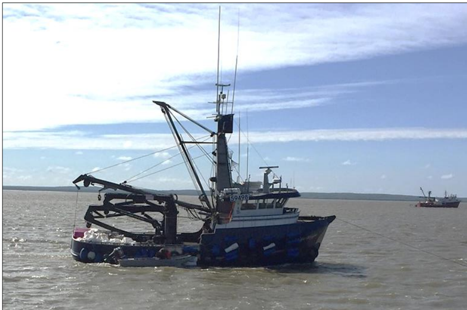
Pacific Knight in Nushagak Bay, about a month before the accident.

On July 25, 2018, about 0630 local time, the commercial fish tender Pacific Knight capsized while at anchor about 11 miles south of Dillingham, Alaska. Two of the three crewmembers on board were able to escape the vessel and were rescued by a nearby Good Samaritan fishing vessel. The third was unable to escape and drowned. About 1,439 gallons of fuel and 300 gallons of hydraulic oil were found on board, with an undeterminable quantity released in the water. The Pacific Knight , valued at $1.55 million, was declared a constructive total loss.