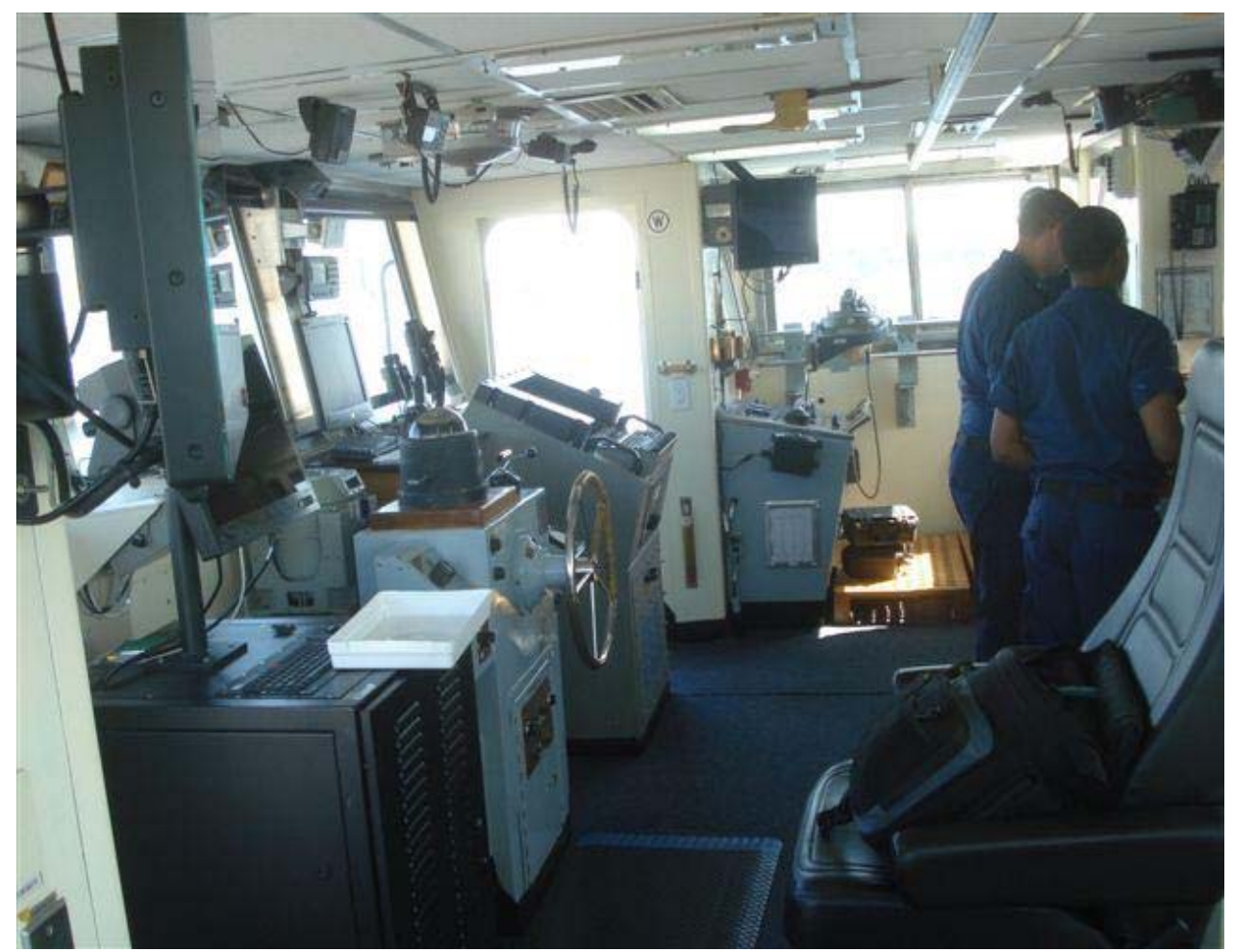
Figure 3. Bridge on the Morro Bay.

chief's duties. During the personnel transition, between five and seven persons were on the bridge at the same time (figure 3).