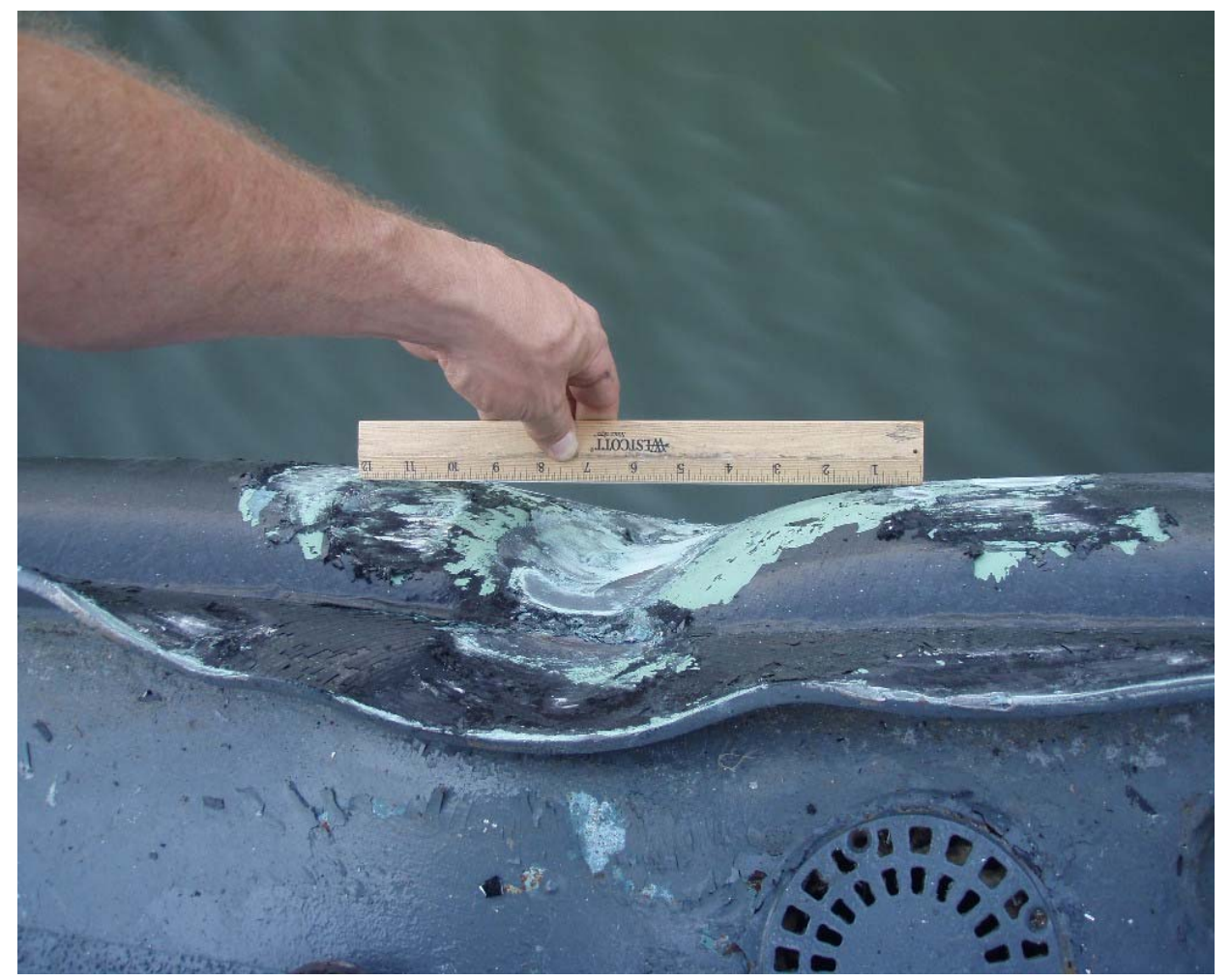
Figure 7. Scraped and inset deck edge on the Morro Bay 's starboard side (looking down).