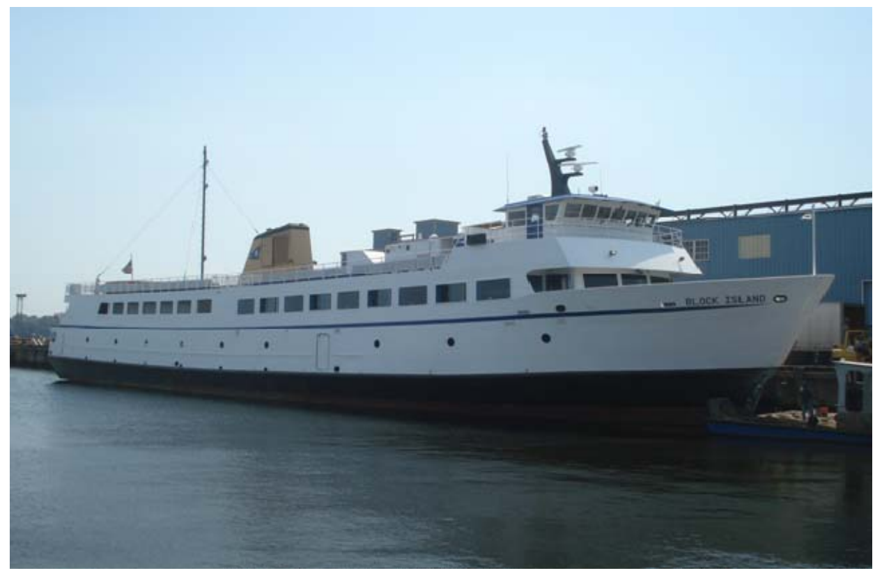
Figure 4. Ferry Block Island.

The master of the Block Island told investigators that when the ferry departed Point Judith, visibility was about 1 mile, and that he therefore placed a security call<sup>13</sup> on very high frequency (VHF) channels 13 and 16. According to Interstate Navigation Co., doing so was company policy whenever the prevailing visibility was less than about 2 miles. Later, as the ferry traveled south onto the open waters of Block Island Sound, the visibility decreased. The master told investigators that he then began sounding the ferry's fog signal. He did not activate the automatic setting, which would have sounded the signal every 2 minutes as required by the "rules of the road,"<sup>14</sup> but instead manually sounded the fog signal, because he did not want the automatic fog signal to interrupt radio and other communication. The master told investigators that he rules of the road called for a prolonged blast every 2 minutes, but stated that, because he manually sounded the horn, he may have waited up to 5 minutes between blasts. The Block Island was traveling at near full-ahead speed, about 15 knots, on a south course.