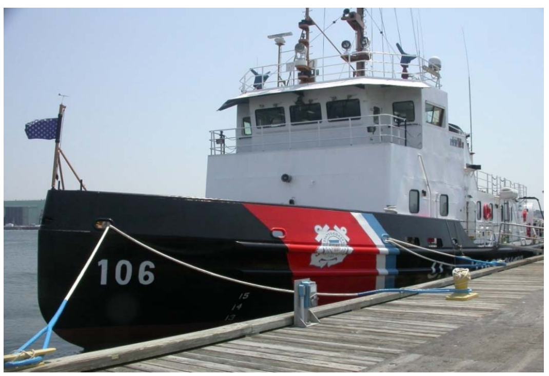
Figure 1. Coast Guard cutter Morro Bay.