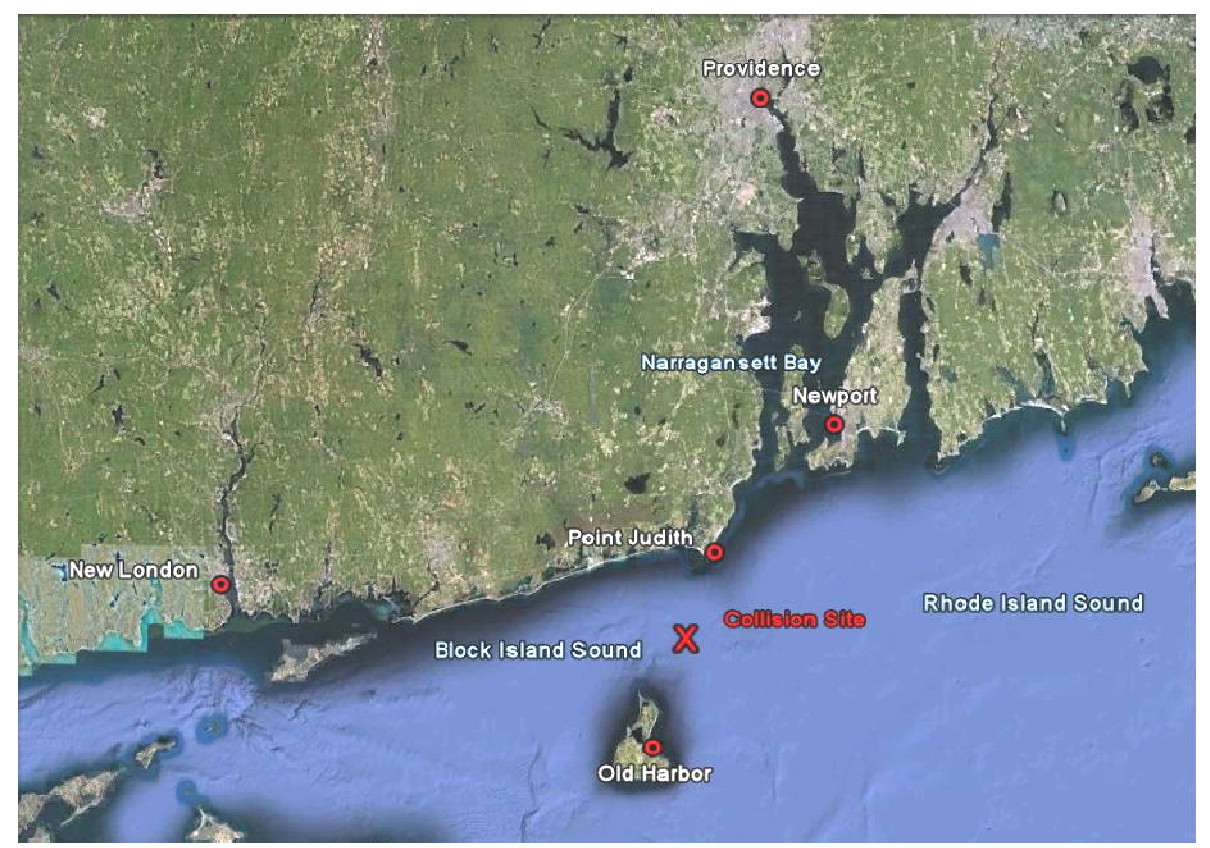
Figure 2. Aerial map of the location where the Block Island and the Morro Bay transited. The Morro Bay was traveling west from Newport to New London; the Block Island was traveling south from Point Judith to Old Harbor. Background by Google Earth.