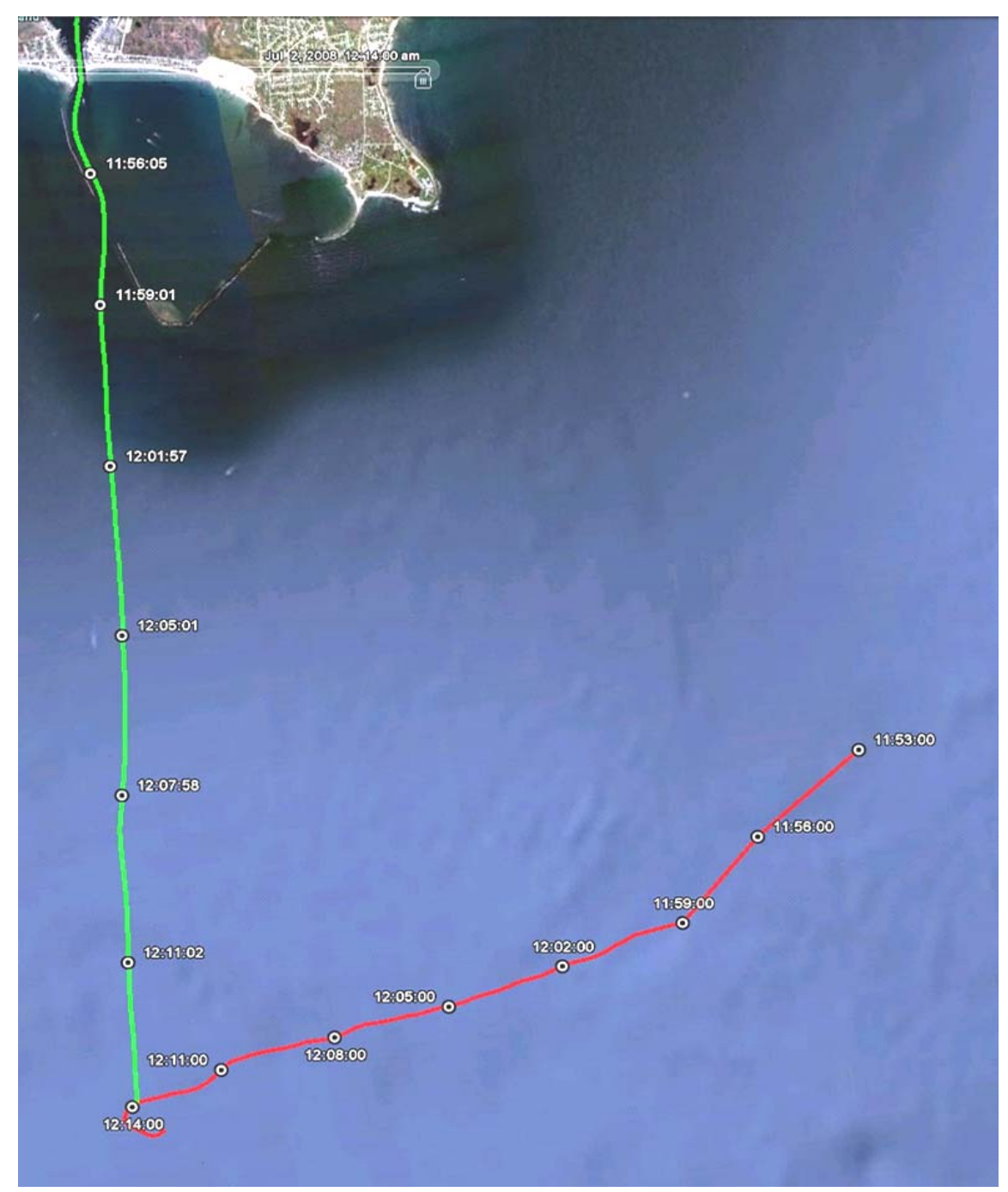
Figure 5. The two vessels' tracklines in the minutes leading up to the collision. The Block Island 's path is shown on the left in green, running south; the Morro Bay 's path is shown on the right in red, running west-southwest. Point Judith is shown in the upper left corner. The tracklines were plotted using available global positioning system (GPS) data.

About 1208, the Block Island and the Morro Bay were about 1.6 miles from each other; the Block Island approaching from the north on the cutter's starboard side, and the Morro Bay approaching from the east on the ferry's port side (figure 5). Neither vessel's crew was aware of the other vessel.