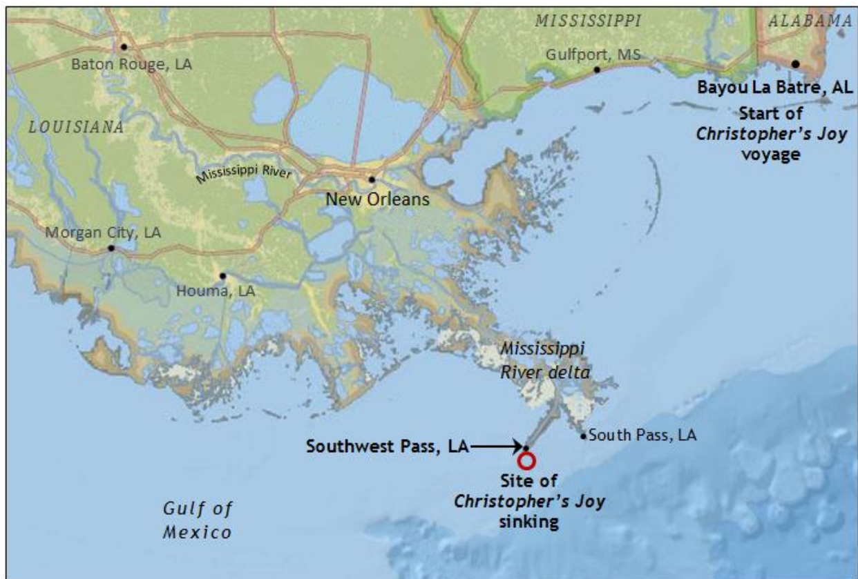
Site of the Christopher's Joy sinking near Southwest Pass, Louisiana.

The Christopher's Joy departed Bayou La Batre, Alabama, on September 13 for a 28-day shrimping trip with the master and three crewmembers on board. The senior crewmember (crewmember 1) was hired by the master, who had worked with him on other shrimp vessels in previous years. This was the first trip for crewmember 1 on board the Christopher's Joy . Crewmembers 2 and 3, nephews of the owner, had previous experience working on the Christopher's Joy but not often as part of the same crew. The master and crewmember 3 had worked together on the vessel for at least one trip, but it was the master's first trip with crewmember 2.