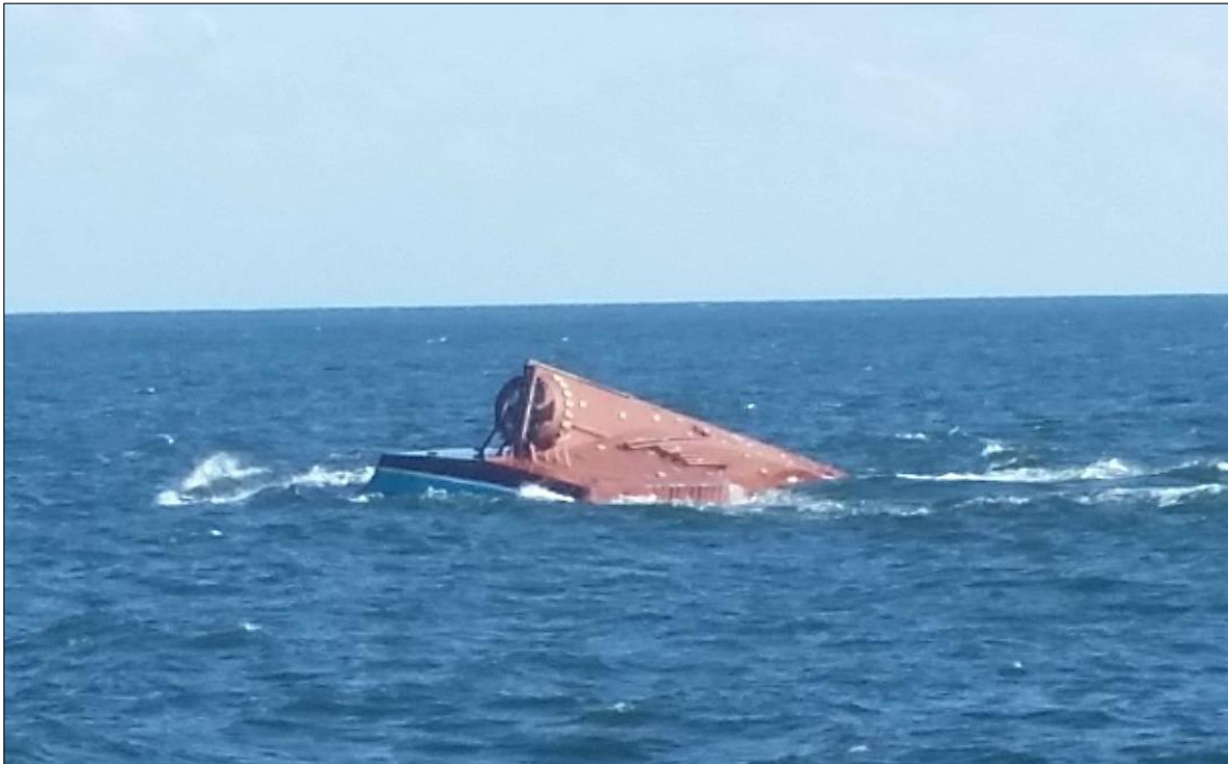
Stern of Christopher's Joy after the two surviving crewmembers were rescued.

Upon notification of the incident, the Coast Guard launched multiple assets from various commands in the area, including a cutter, a helicopter, a fixed-wing airplane, and a small boat, to search for the missing crewmembers. A nearby commercial helicopter also assisted in the search. At 1738, a Coast Guard rescue swimmer deployed to the overturned hull tried to communicate with crewmember 3, who was believed to be trapped in the engine room. The rescue swimmer heard no response, however, and did not attempt to enter the overturned hull.