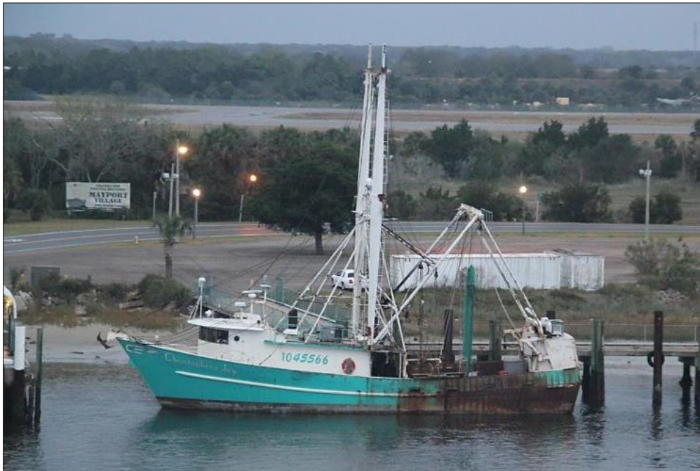
Fishing vessel Christopher's Joy moored in Mayport, Florida, in 2004.

About 1430 on September 23, 2014, the fishing vessel Christopher's Joy capsized while trawling in the Gulf of Mexico near Southwest Pass, Louisiana. The vessel sank later that day at 2057. The master and one crewmember suffered minor lacerations, and the remaining two crewmembers are presumed dead.