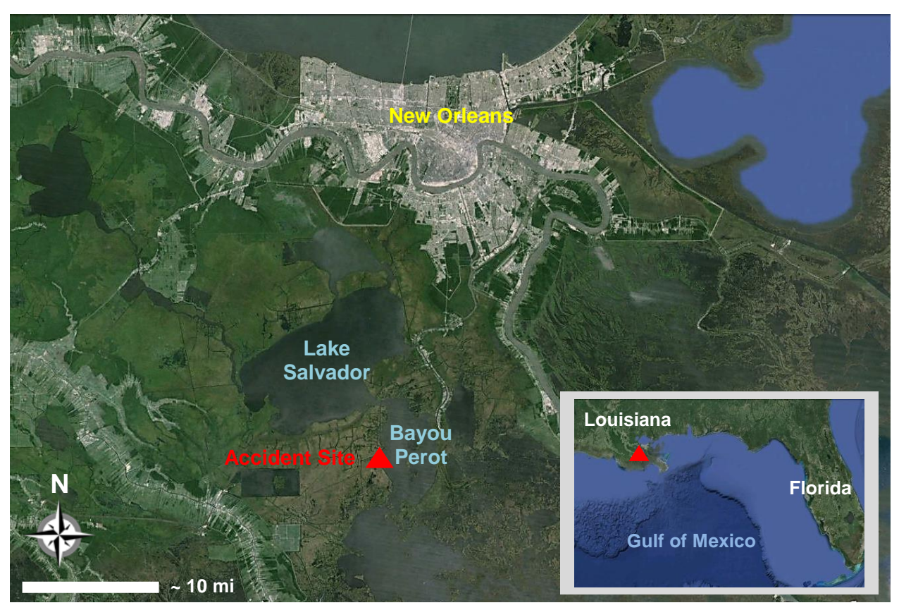
Satellite image of the accident area, located about 20 miles south of New Orleans, Louisiana. (Background by Google Earth)

On the day of the accident, the Shanon E. Settoon was transiting from the Square Mile Energy facility on Lake Salvador, pushing the tank barge SMI 572 loaded with 93,000 gallons of crude oil. Four crewmembers were on board the vessel. That afternoon, the captain called the Louisiana Delta Oil Company (LDOC) facility on Bayou Perot to determine if the facility had additional crude oil available to load to top off the SMI 572 . The tank gauging contractor at LDOC confirmed that the facility had 1,600 barrels available to load, and about 1330, the captain told him that the vessel would arrive later that evening for loading the following morning.