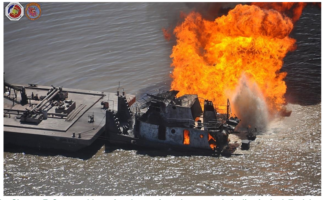
The Shanon E. Settoon ablaze after the gas from the ruptured pipeline ignited. Tank barge SMI 572 is positioned forward of the vessel.

On March 12, 2013, at 1745 local time, the towing vessel Shanon E. Settoon was pushing a loaded tank barge in Bayou Perot (about 20 miles south of New Orleans, Louisiana) when it struck a submerged pipeline. The collision caused a release of liquefied petroleum gas, which entered the air intake for the main propulsion engines and ignited. The Shanon E. Settoon was destroyed by the fire; the tank barge had limited fire damage and did not release any of the 93,000 gallons of crude oil it was carrying. The four crewmembers on board the Shanon E. Settoon escaped from the vessel, but one of them sustained second- and third-degree burns from which he died 1 month later.