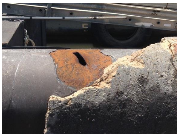
Left, the Shanon E. Settoon 's damaged propeller blade during postaccident survey; right, the damaged pipeline and its protective casing.

The Shanon E. Settoon was completely burned and declared a total loss. A survey revealed that the vessel's portside propeller had struck and penetrated the pipeline. When the gas reached the surface of the water, it was drawn into the main engines, where it ignited. The explosion caused an intense fire, which was fed by the escaping gas under pressure. The Shanon E. Settoon had about 1,000 gallons of diesel fuel on board, which was spilled in the accident.