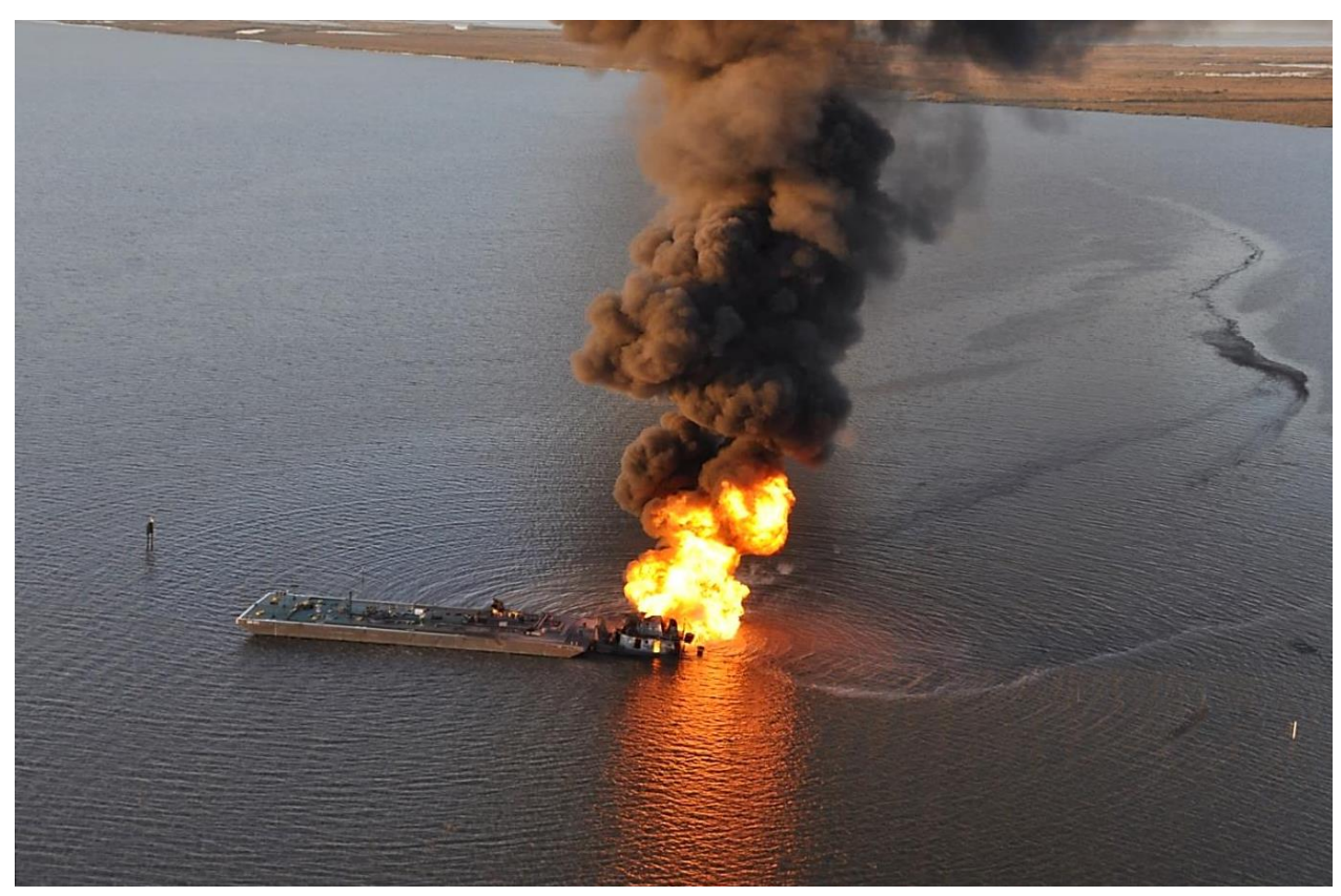
The ablaze Shanon E. Settoon and the barge SMI 572. An oil sheen can be seen on the water extending out from the tow.

On realizing that the tow had struck an object, the captain notified the LDOC contractor and tried to maneuver away from the obstruction. A crewmember told investigators that, about that time, he twice heard a noise and saw a disturbance in the water that pushed the stern of the vessel upward. He and another crewmember began to head forward on the vessel toward the barge when he heard the captain say that he needed help shutting down the main engines to prevent a spark. The crewmembers began to walk aft when the main engines exploded and fire engulfed the Shanon E. Settoon . The captain and the three crewmembers abandoned the vessel. Two of the crewmembers retreated to the barge, while the captain—who was badly burned—and another crewmember ended up in the water and made their way to shore. Chevron shut off the pipeline; however, the remaining gas in the pipeline continued to burn for several days.