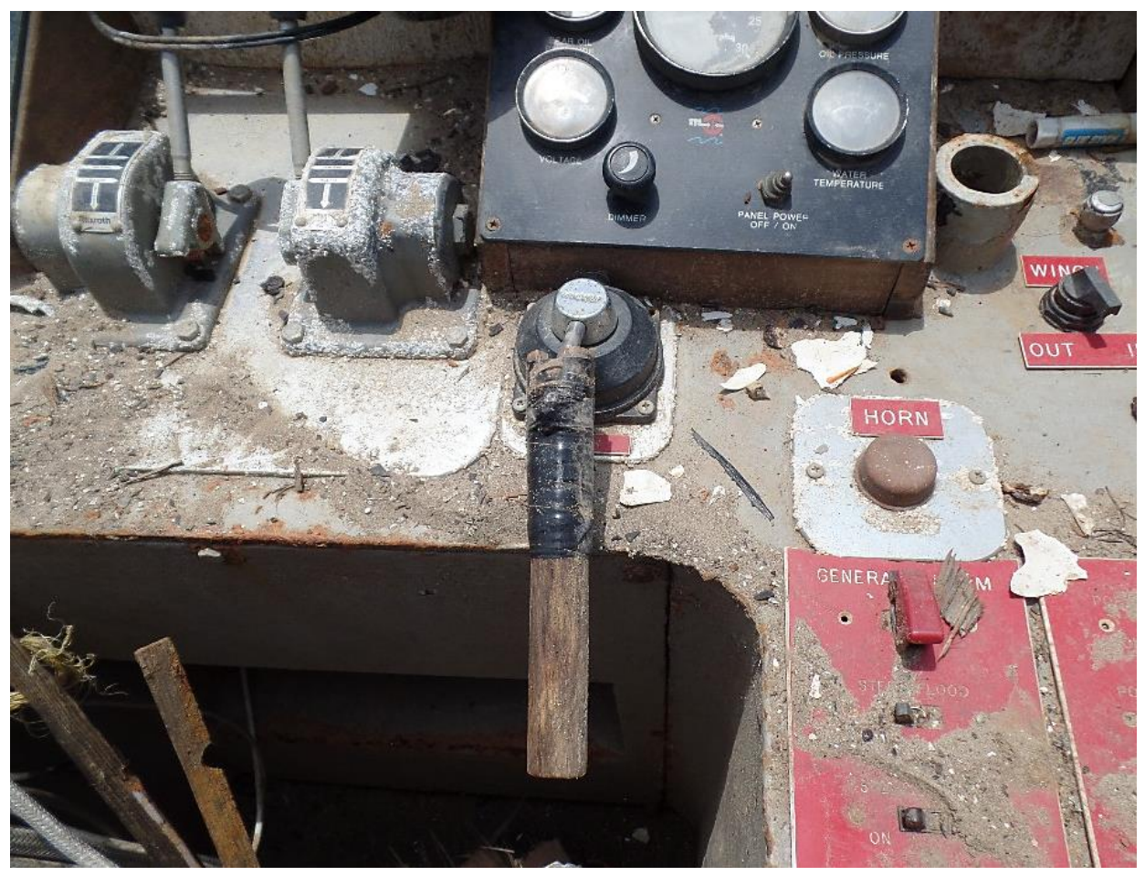
Postaccident photo of the Natalie Jean 's primary steering control, which had been modified with a wooden rod taped to the end to extend it.

The pilot told investigators that he was not familiar with the vessel's steering system and that it took some time for him to get used to it. The Natalie Jean was equipped with a double-flanking rudder system and the primary steering control consisted of a short "stick" with a wooden rod taped to the end in order to extend it. The pilot told investigators that he "had to kind of work with that a bit," but he did not elaborate.