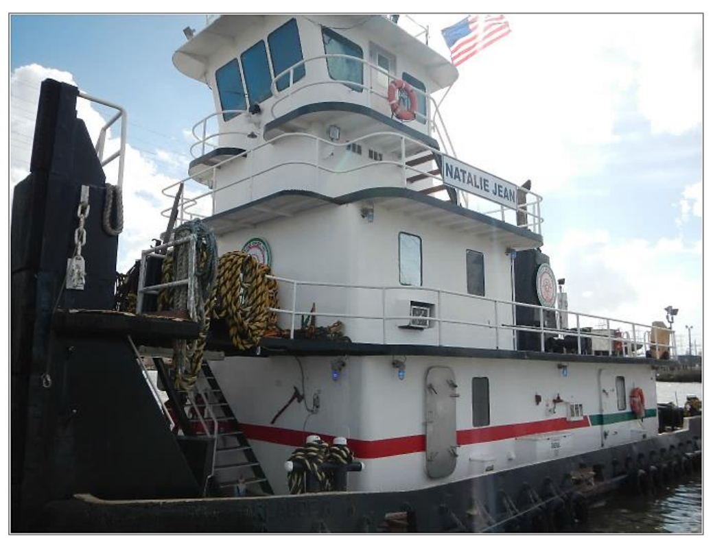
Natalie Jean before the accident. NTSB/MAB-19/13

About 0938 local time on March 12, 2018, the towboat Natalie Jean was pushing an empty fuel tank barge upriver on the Lower Mississippi River near New Orleans, Louisiana, when the towboat became caught on the port anchor chain of the anchored bulk carrier Atlantic Fairy . The towboat capsized and quickly sank; the barge broke free and collided with the bulk carrier. Two of the three crewmembers on board the towboat died in the accident. Damage estimates exceeded $500,000.