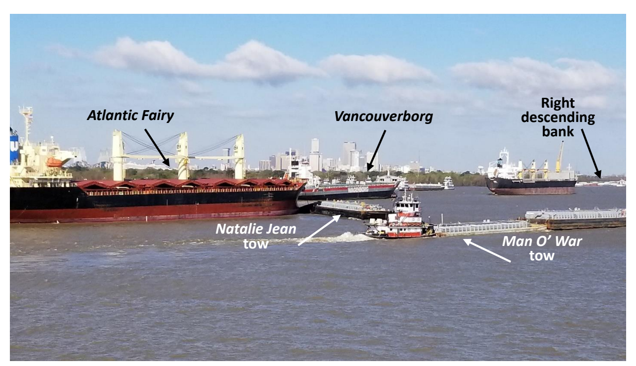
Photo (looking upriver) of the Natalie Jean tow perpendicular to the Atlantic Fairy. The towboat has capsized and is sinking.

The tow then became pressed about perpendicularly against the bulbous bow of the Atlantic Fairy and also against the bulker's starboard anchor chain. The Natalie Jean subsequently heeled to port, and the port tow wire parted under tension. Seconds later, the Natalie Jean capsized and the barge broke free. The Natalie Jean then quickly sank.