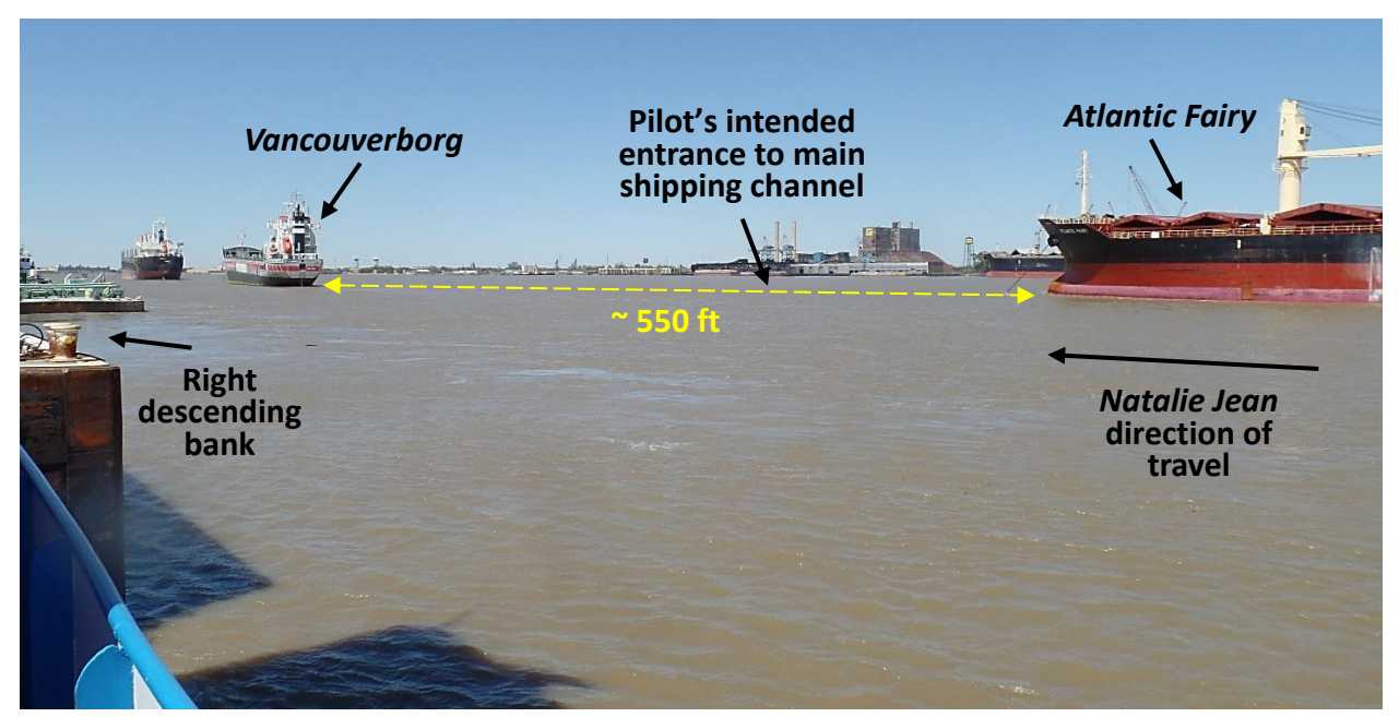
Photo taken from the towing vessel Earl Gonsoulin , moored along the right descending bank looking upriver.

The pilot said he heard the Atlantic Fairy 's anchor chain getting caught on the towboat. According to video footage from a nearby factory and MRTIS data, the tow suddenly made a sharp turn to starboard.