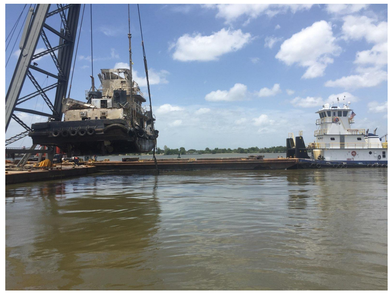
Natalie Jean being salvaged. The vessel was upside down on the river bottom and sustained damage to the shaft and flanking rudders in the recovery efforts.