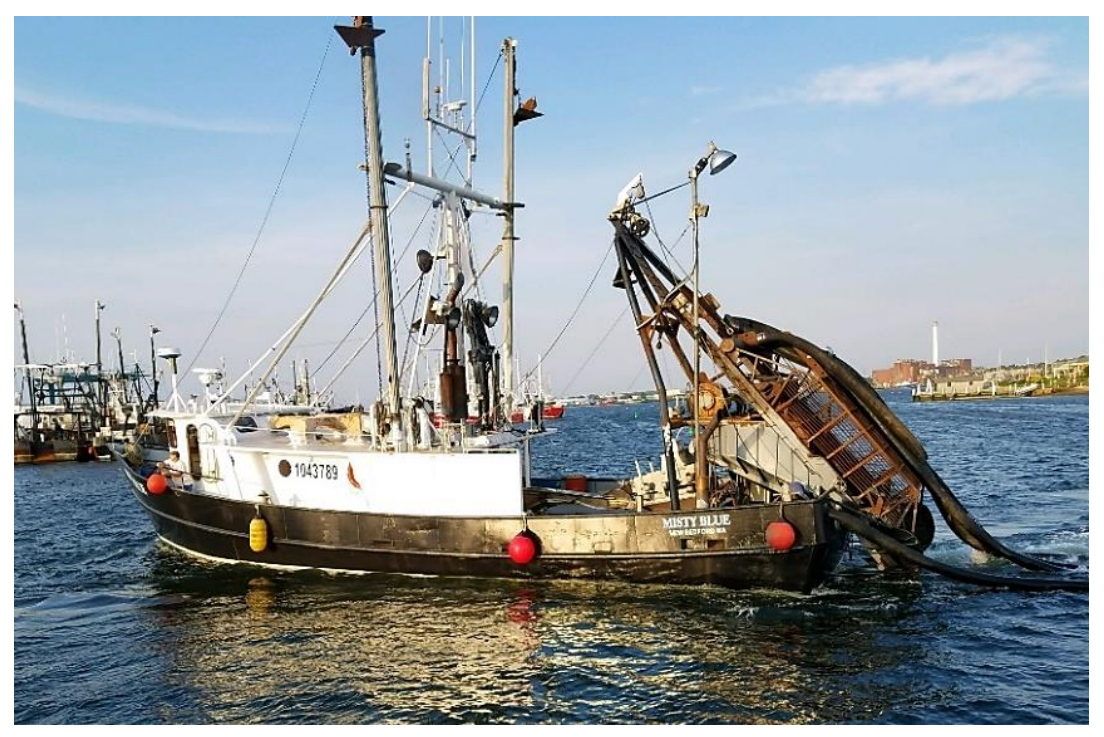
Misty Blue in June 2017 in Fairhaven, Massachusetts.

On December 4, 2017, at 1806 local time, the uninspected fishing vessel Misty Blue was harvesting clams 9 miles southeast of Nantucket, Massachusetts, when the port clam tank began flooding and the vessel subsequently capsized and sank.<sup>1</sup> Two crewmembers were trapped on board and perished when the vessel sank; the other two crewmembers managed to escape and were rescued by a nearby fishing vessel. Oil sheens were observed.