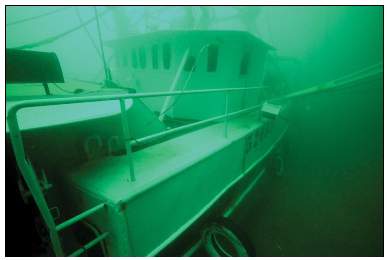
Figure 2. Sunken wreckage of Lady Mary, May 2009.