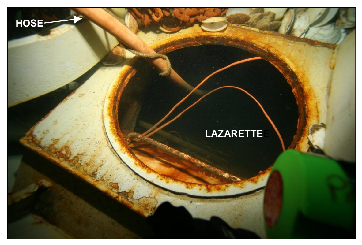
Figure 6. Open access hatch to lazarette, showing hose emerging from inside and tied overboard. A vessel's lazarette is its aftermost compartment below its main deck, typically accessed by a deck hatch.