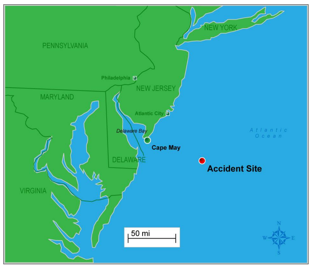
Figure 3. Area of Atlantic Ocean where Lady Mary sank.

At about 0000 on March 24, the sole survivor and another crewmember finished their 18hour shift and went to bed in the belowdecks bunkroom (refer to figure 4). The survivor told the marine board that everything was normal at the time—the master was steering, the other crewmembers were on deck processing the catch, and the dredge was out, dragging for more scallops. The Lady Mary was proceeding west-northwest at 2–5 knots at that time, according to data from its vessel monitoring system (VMS),<sup>3</sup> which transmitted the vessel's position every 30 minutes. A speed of 3–5 knots is normal when dredging for scallops, according to an NMFS fisheries management specialist.