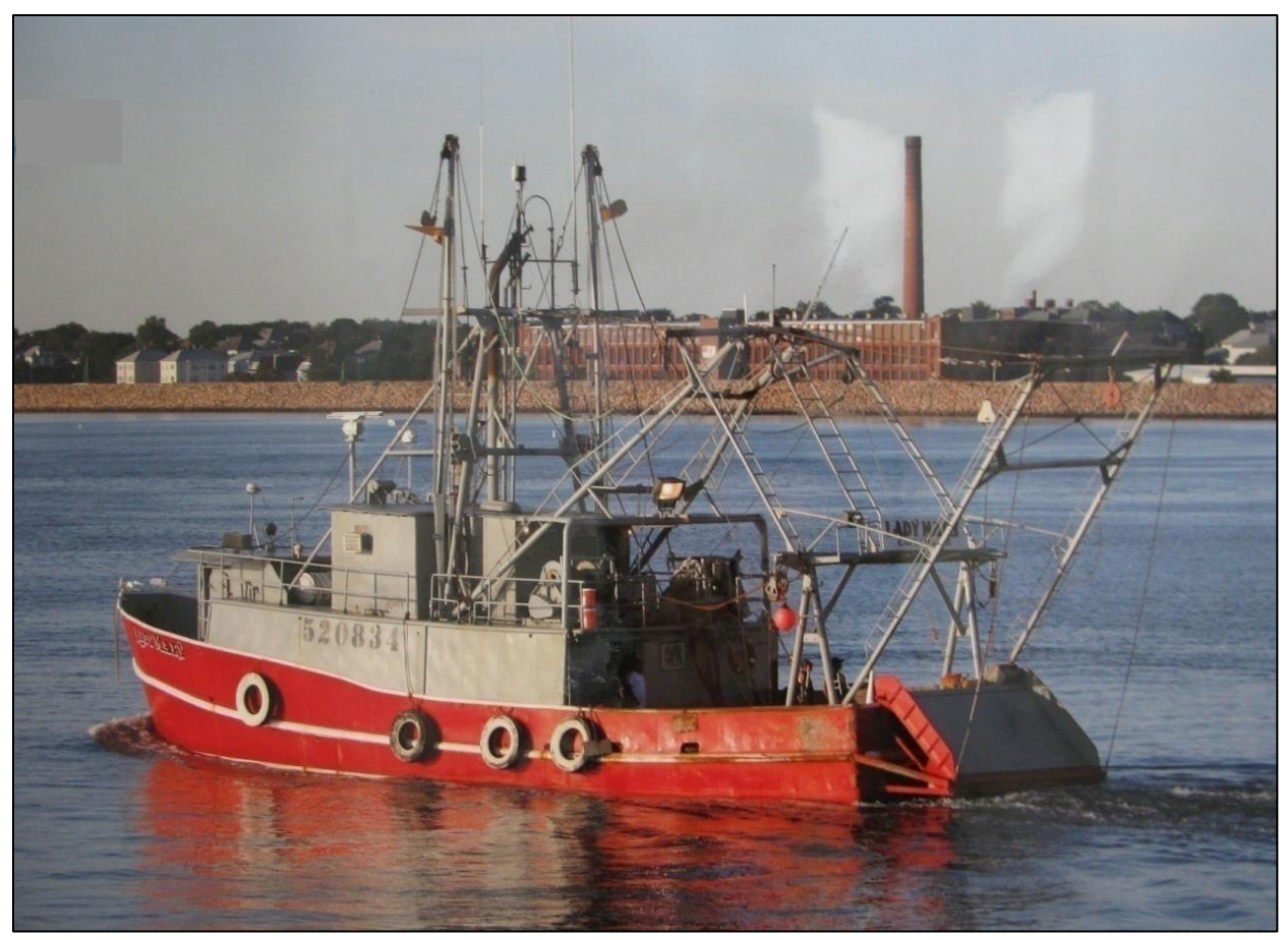
Figure 1. Fishing vessel Lady Mary outbound from New Bedford, Massachusetts, July 2006.

The wreckage was surveyed by divers in May 2009 and extensively photographed (figure 2). In October 2009, the Coast Guard, with the assistance of the U.S. Navy, retrieved the rudder and other equipment from the sunken vessel, which was sent for analysis to the materials laboratory at NTSB headquarters in Washington, DC. As of the date of this brief, the Coast Guard had not published its report on the Lady Mary accident.