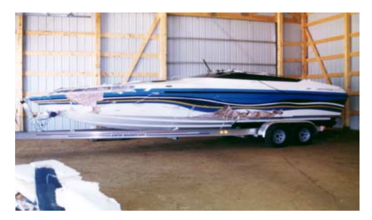
Figure 3. Advantage, postaccident

When divers recovered the Advantage, its throttle was in the full speed position. The Advantage was capable of reaching speeds of 60 mph. The Bayliner's gearshift lever was in the forward position and the throttle was in the idle position. Also, the throttle cable at the engine was against the idle screw, which conforms to the setting of the throttle lever. However, the Bayliner's control console with the speed controls was severely damaged, and it was not possible to determine what, if any, effect the boat's operator or the collision impact had on the engine controls. The Bayliner's damage path is consistent with substantial forward movement, and the Safety Board calculated that, at impact, the Bayliner was traveling between 18 and 35 mph; the Advantage's estimated speed was 50-60 mph.<sup>6</sup>