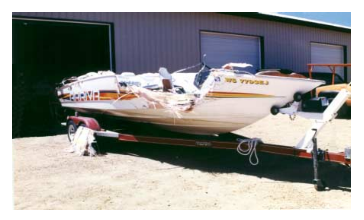
Figure 2. Bayliner, postaccident

The Safety Board investigator measured the angle of the damage path across the Bayliner at approximately 45° on the starboard bow. (See figure 2.) The fixed fiberglass deck over the cuddy cabin of the Bayliner was knocked off by collision. Minnesota Highway Patrol investigators conducted a laser survey of the Bayliner, which was used in a computer analysis to determine the angle of the damage path. The analysis showed that the Advantage's bow struck the Bayliner on its starboard side forward, and then passed over the motorboat on a path about 43° to 45° to that vessels centerline axis, and that the Advantage probably rotated to the left as it passed over the Bayliner. (See figure 3.)