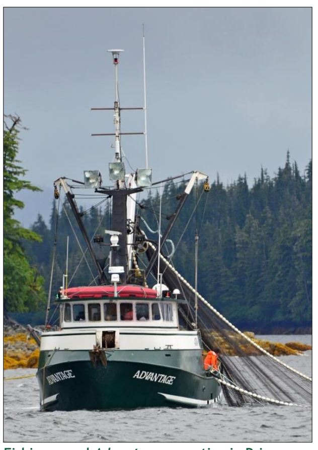
Fishing vessel Advantage operating in Prince William Sound, Alaska.

Waterway Gulf of Alaska lies south of Alaska in the northeastern Pacific Ocean