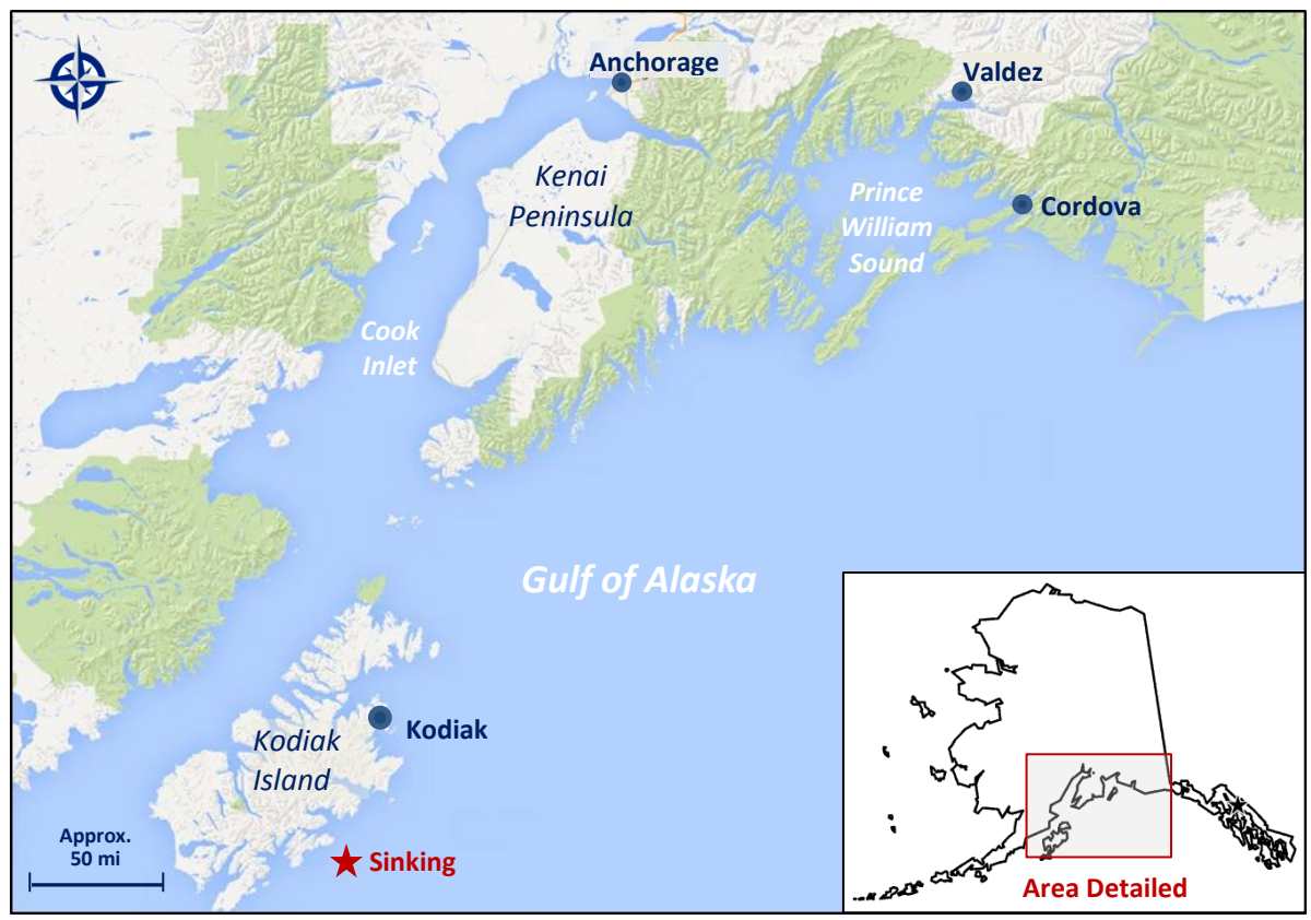
Location of the sinking of the fishing vessel Advantage , 14 nautical miles southeast of Kodiak Island, Alaska. (Background by Bing Maps)

lube oil products and diesel fuel. The Advantage then stopped at Alaska Pacific Seafoods to take on its third and last load of 33 cod pots. Two deckhands secured the cod pots on deck while the third deckhand stowed the stores and groceries for the trip.